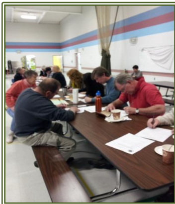
2013 Community Visioning Session

When North Stonington residents were asked to choose phrases that resonated with them with respect to the future of North Stonington, they selected the terms Livability, Sustainability, Progress and Community.