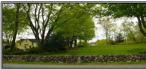
Attractive stonewall and landscaping along Main Street