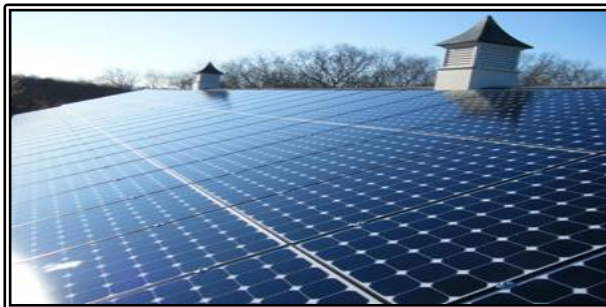
Solar Panels at Town Garage