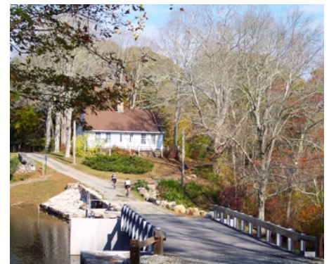
1750 Hewitt Farm House