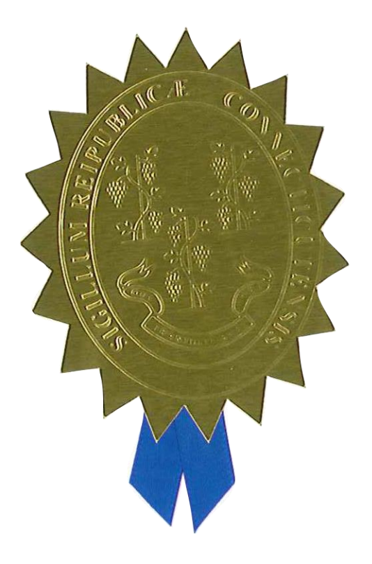
Ned Lamont Governor