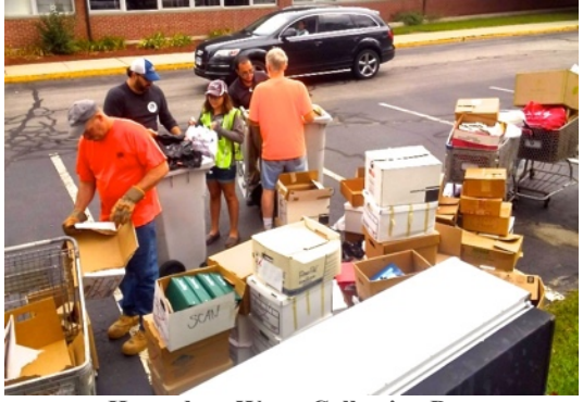
Hazardous Waste Collection Day

Our highway crew has worked hard all summer on a multitude of projects including tree work, repairs to drainage on Pinecrest, milling on Swantown, & chip sealing done on various roads throughout town including Anna Farm Roads and Main Street/Wyassup Road. Guard rails throughout town were replaced and are now much safer. The crew also completed painting and various tasks at our new Recreation building that is now beginning to be used for certain classes and by some 501(c)(3) non-profit organizations for meetings. In September the town worked with SE CT Regional Resource Recovery Authority to service nearly 400 customers on Hazardous Waste Collection Day. This was a 28% increase over last year's participation and a 46% increase over our 8 year average. We appreciate everyone who took this opportunity to recycle.