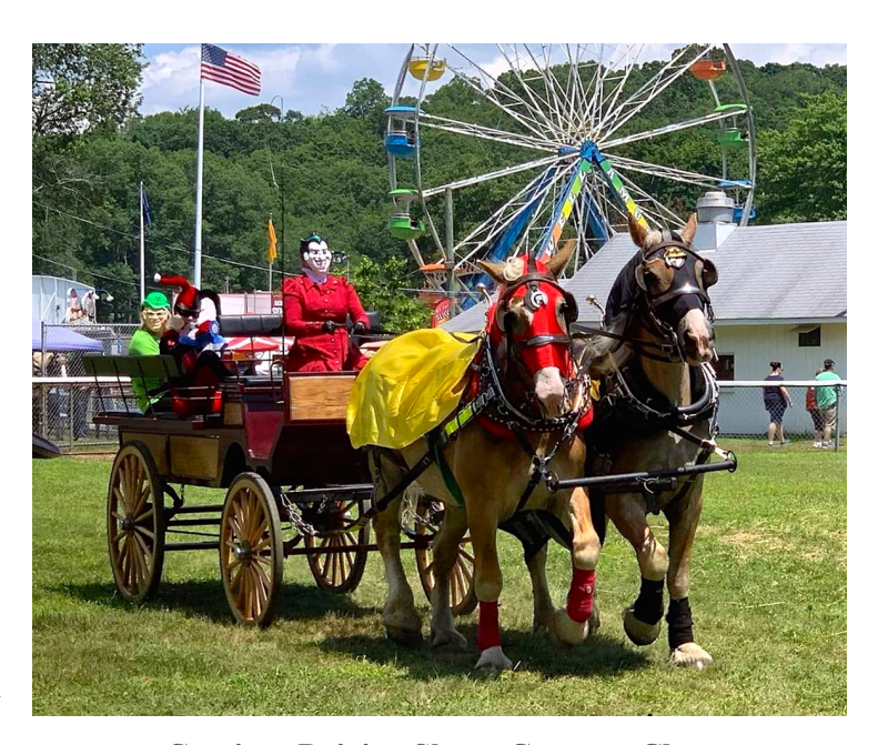
Carriage Driving Show: Costume Class

Our monthly meetings continue throughout the winter: 2<sup>nd</sup> Tuesday of each month, 7pm at the North Stonington Fire Company on Rocky Hollow Rd. If you and/or your family members are interested in joining the Fair Committee, please join our meeting!