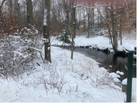
Volunteers removed the bridge & dam

Now, with the drought over, water again flows freely along that section of brook. We welcome the public to hike the Fowler Grindstone Preserve. The Trail heads are on Fowler Road