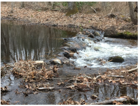
Illegal rock dam on Pendleton Hill Brook