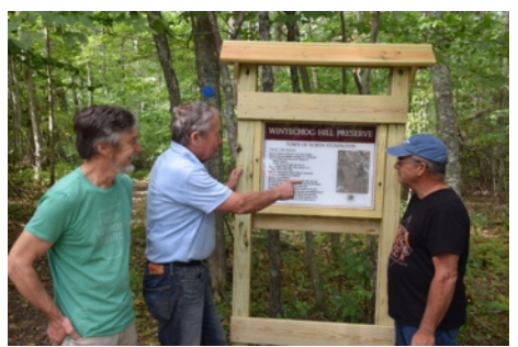
Committee members with a new sign

We anticipated lighter sales of the 2021 Community Calendar given the pandemic, and purchased less than usual, but sorry to say, we should have maintained our normal production. They're sold out. We're already working on the 2022 calendar; highlighting the farms, farmers and their animals.